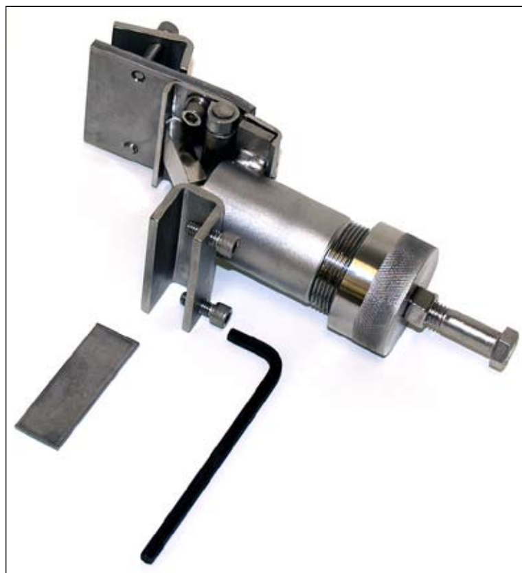
(Figure 2) - PM HINGE (SHOWN WITH MOUNTING BOLT)

The PM Hinge (or Pressure Membrane Counterbalanced Hinge) is an optional accessory item for both the 1000 and 1500F1 Extractors.