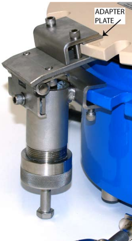
(Figure 5) - Mounted on 1500 Extractor

The Adapter Plate fits underneath the top clamp of the PM Hinge and provides the proper spacing to match the clamp height ( see Fig. 6 ). The PM Hinge should be mounted to the back of the 15 Bar Ceramic Plate Extractor with the pressure inlet fitting spaced 45° to the right.