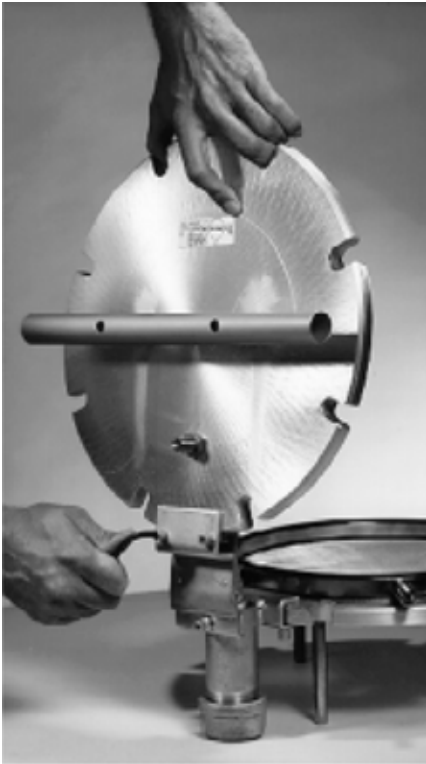
(Figure 4) - STEP TWO

Holding the Extractor Lid firmly with both hands, slide the lid into the top mounting bracket of the PM Hinge as shown in Fig. 4 . Orient the Extractor Lid in such a way so that the handle is parallel to the bench and the pressure fitting next to the PM Hinge. Center the mounting bracket in the section between two bolt slots in the lid. Lightly tighten the two mounting screws. The Extractor Lid may now be closed and the PM Hinge will counteract its weight.