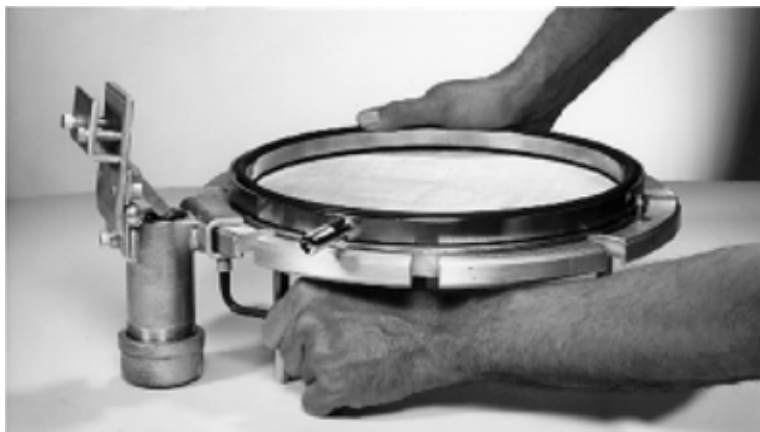
(Figure 3) - STEP ONE

Mounting is accomplished in two simple steps. Pictures have been provided to facilitate the mounting process.